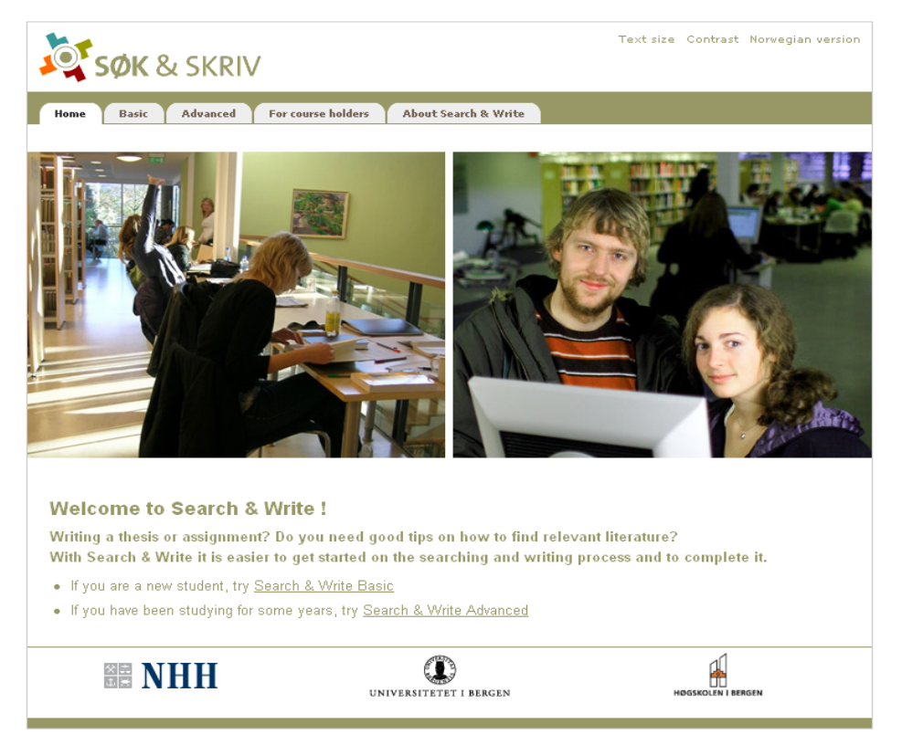
FIGURE 1 — SØK & SKRIV HOMEPAGE

The model describes a number of factors that interact to define a teaching/learning situation. Hiim and Hippe (1998) build upon Bjørndal and Lieberg's (1978) model and distinguish the following didactic categories: learning goals, content, learning process, learning conditions, settings, and assessment.<sup>2</sup>