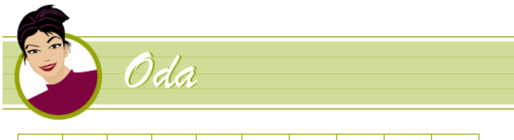
FIGURE 5 — EXCERPT FROM ODA'S DIARY