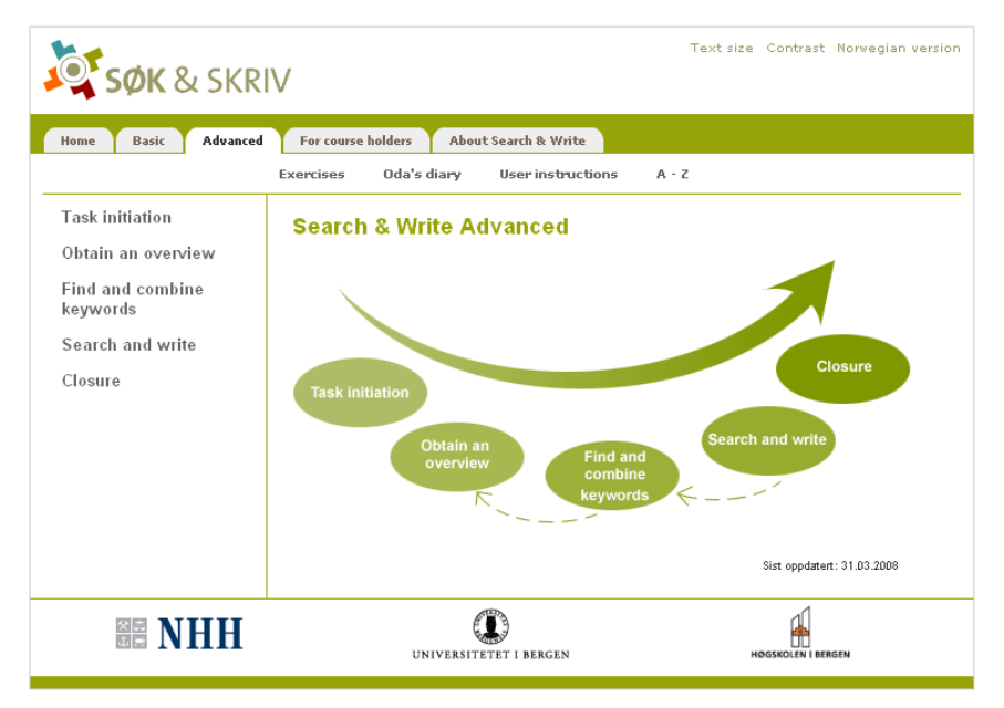
FIGURE 3 — SØK & SKRIV ADVANCED

In the objects, writing and information searching are approached as processes that go hand in hand in the students' wider process of constructing meaning. Søk & Skriv Advanced also covers other essential information literacy components, such as the creative, critical, and ethical use of information.